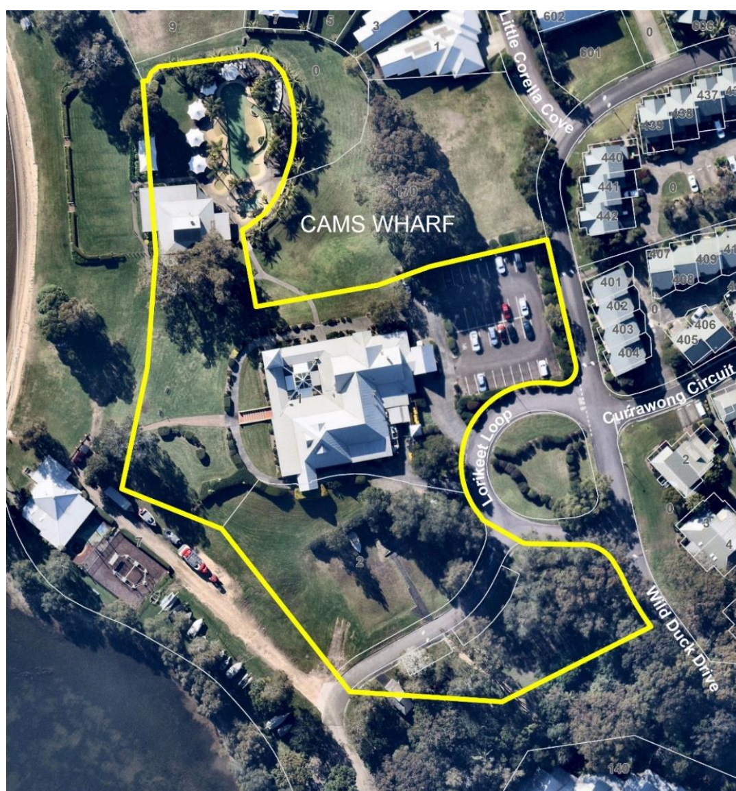
Figure 1: Subject land within Raffertys Resort

The planning proposal was initiated by the landowner, Iris Capital and applies to land at 1 Wild Duck Drive and 2 Lorikeet Loop, Cams Wharf. The site is within Raffertys Resort which has been operating as a mixed-use tourism facility since 1993. The existing resort contains a range of residential and tourism units, as well as a tavern, cafe and recreation facilities managed under a community title scheme. The part of the resort subject to the planning proposal is adjacent to the foreshore of Lake Macquarie and is predominantly cleared of vegetation (See Figure 1). The site is zoned SP3 Tourist which permits a range of tourism land uses. Dwellings are also permitted within the site, as an additional permitted use under Clause 7.14 of the LMLEP 2014 .